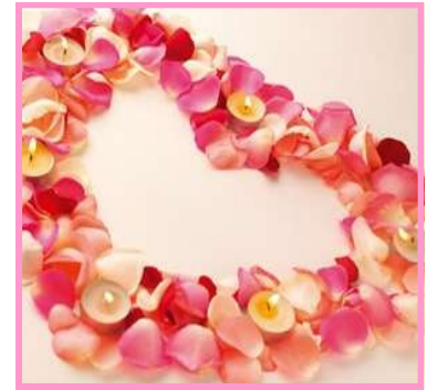
Happy Valentine's Day

Society of Professional Women in Petroleum